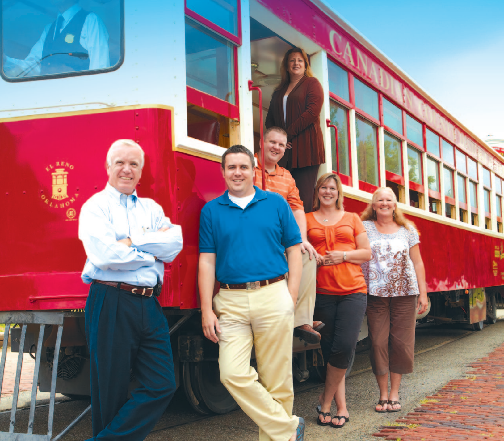
The Advantage Insurance Group team

“For an agency of our size AMS360 is a great equalizer. It makes us more efficient so we have more time to spend building relationships.”